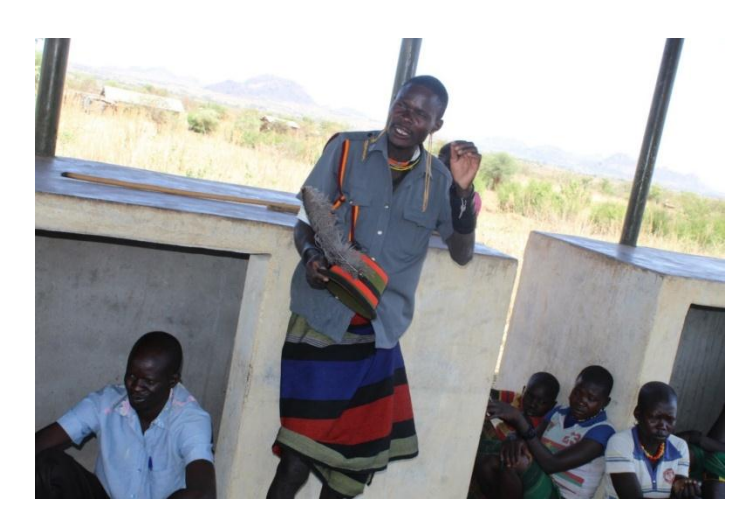
Youth in Sidok– Kaabong district in a Focus Group Discussion