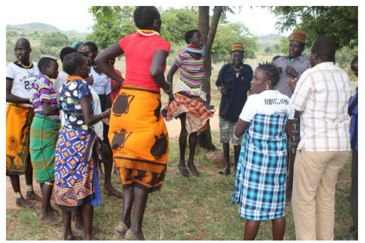
Young adults/youth performing a traditional daNce in Kaabong