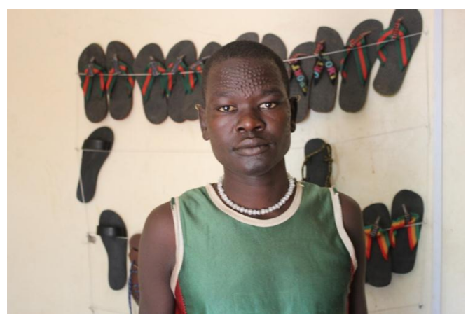
A young a dult in a workshop where me makes local shoes – Kotido district