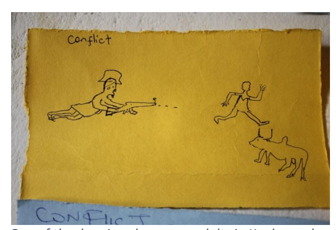
One of the drawings by young-adults in Kaabong showing the current context of conflicts in the area