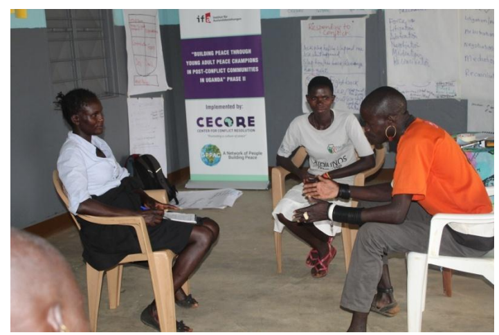
Participants during a reole play in medidiation during a traning in peacebuiding and conflict transformation in Kaabong