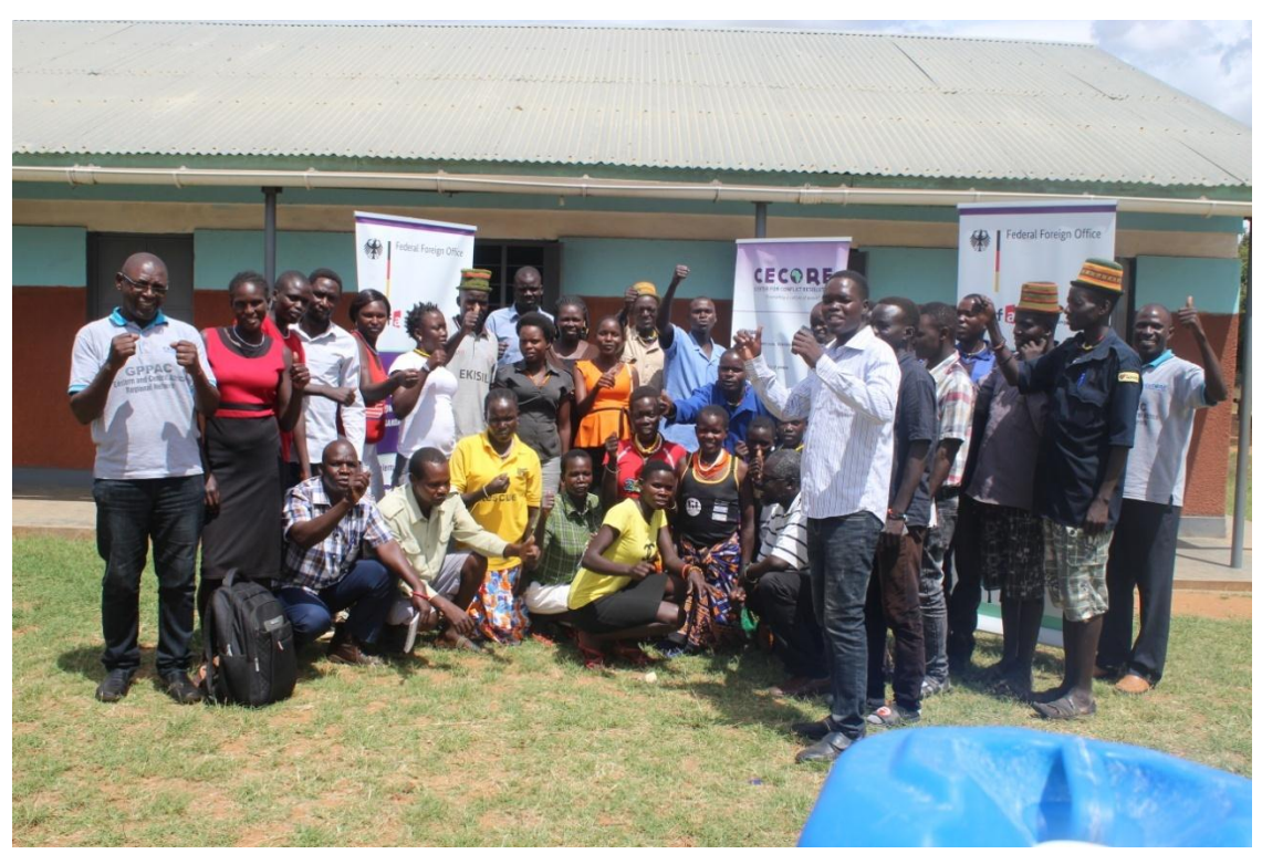
Young adult and youth groups (peace champions) after completing a training in peacebuilding and conflict transformation in Kaabong district, Karamoja region.

This brief provides a snap-shot of a unique tailor-made project in addressing conflict and livelihood challenges among young adult and youth groups in post-conflict communities in Uganda. Read about "My story"; the sometimes unbelievable, horrific, but real-life stories of former ex-combatants/warriors. The brief calls you to stay-tuned to this page for "My story – part 2"; amazing stories of change in the lives of young adults and youth in post-conflict communities – after the project intervention. And some pictorial to affirm and connect the words with realities on the ground.