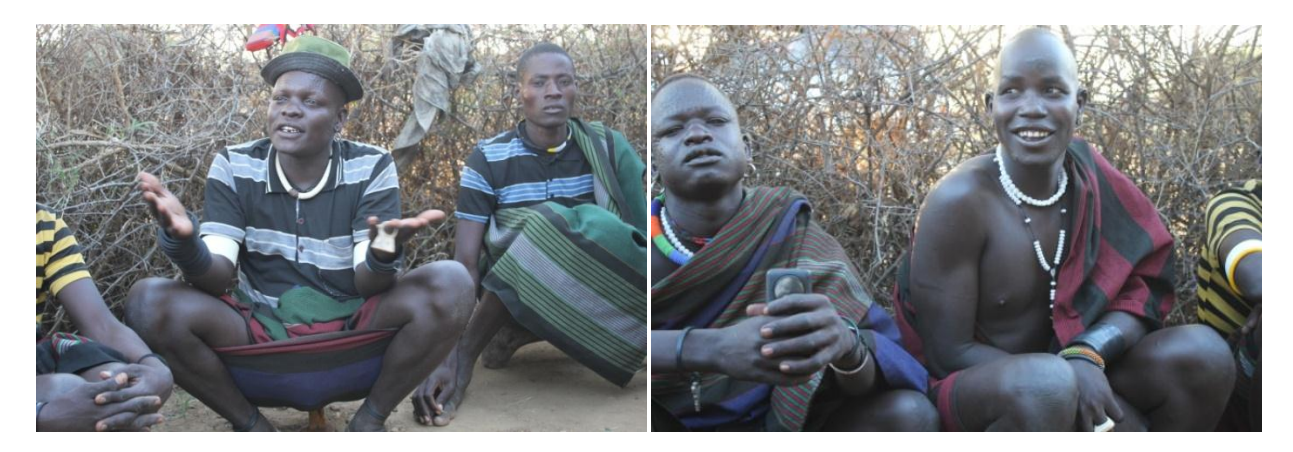
Young adults.youth during a baseline study in Kotido district